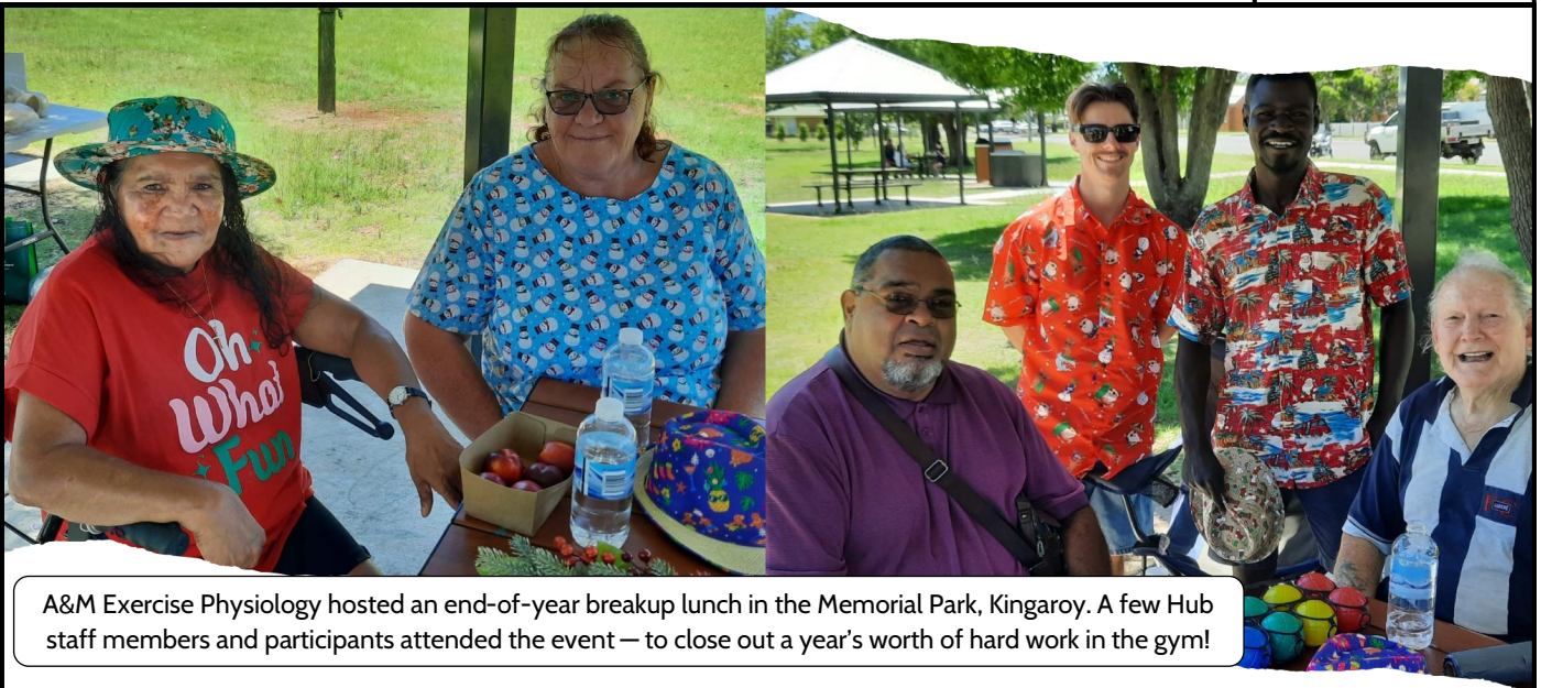
A&M Exercise Physiology hosted an end-of-year breakup lunch in the Memorial Park, Kingaroy. A few Hub staff members and participants attended the event — to close out a year's worth of hard work in the gym!